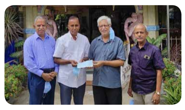
On 09.02.22 ₹10,000 was donated on behalf of our club to the Sri Sathyanarayana Charitable Trust, Nanmangalam and Donated for Corona Relief. They are running a old age home as a free service to deserving senior citizens.